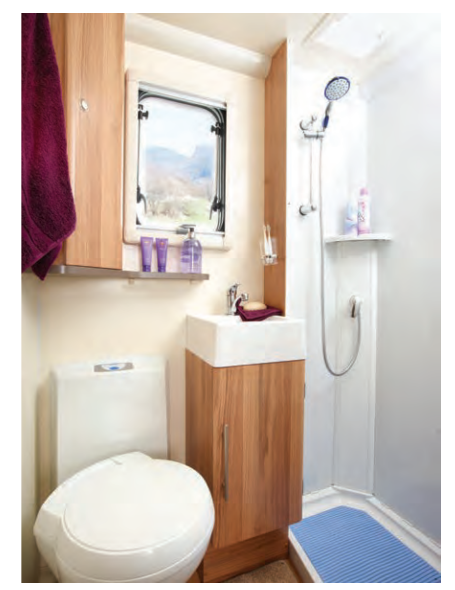
Approach SE 620 Washroom