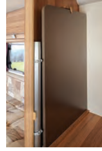
Dedicated table storage