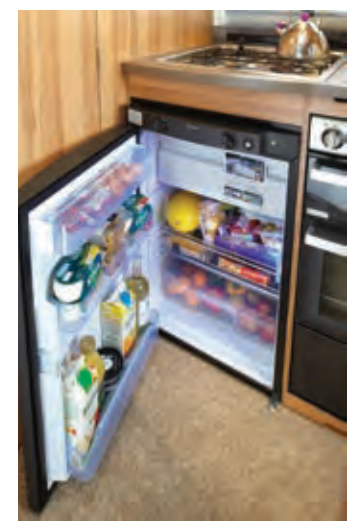
Dometic 115 litre fridge (model specific)

*Terms and conditions apply. Please visit www.baileyapproach.co.uk for more information on the Approach SE warranty package.