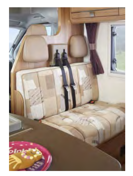
Four Three point seatbelts fitted as standard in dedicated rear passenger area (745 & 760 only)