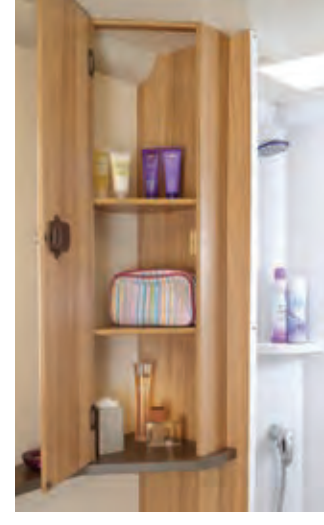
Dedicated washroom storage

Belfast style washroom sink (model specific) Fully lined separate shower cubicle