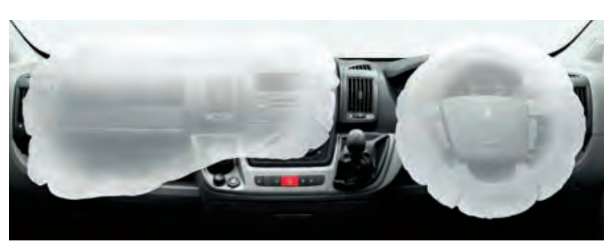
Driver and passenger airbags