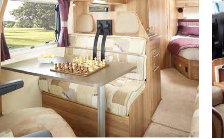
Approach SE 745 Side dinette with 2 dedicated rear passenger seats