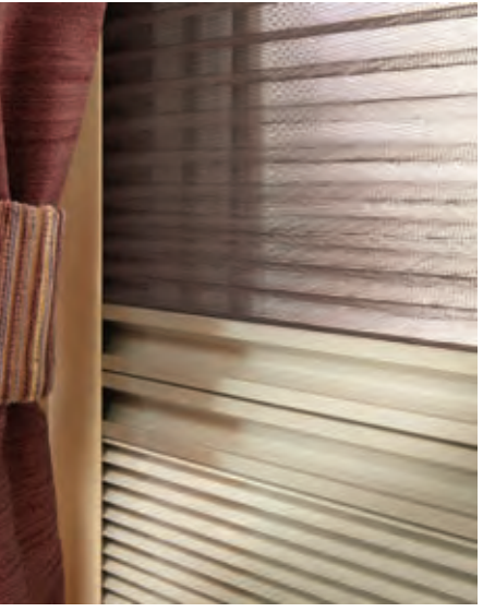
Horrex pleated flyscreens and sunblinds