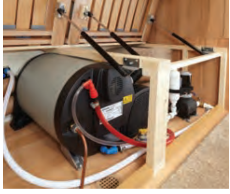
Dual fuel Truma combi boiler with en-route operation