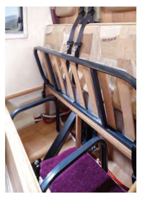
Additional strengthening to furniture in dedicated rear passenger area (745 & 760 only)