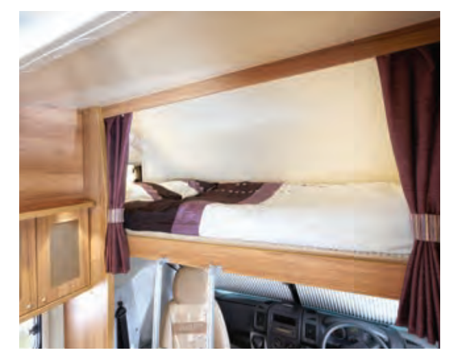
Approach SE 760 Over cab bed (Bed linen available as a cost option)

As people have come to expect from Bailey, models are extremely well specified and are packed with the home comforts owners will need for a relaxing and enjoyable holiday. Notably these include fully equipped kitchens featuring large capacity Dometic 8-Series refrigerators, a new Thetford 'anti-rattle' oven, a stainless steel 700 watt microwave and cleverly designed washrooms all of which feature fully lined separate shower cubicles.