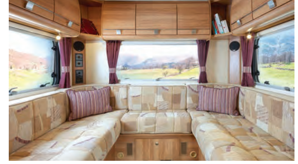
Approach SE 760 Rear lounge

Once at your chosen destination the Approach SE provides you with a light and spacious habitation area, with an internal headroom of 1.96m and an internal body width of 2.27m, which are beautifully showcased by large PolyClassic windows, complete with pleated cassette blinds, and clear canopy Heki rooflights throughout. This space is then expertly managed to ensure storage capacity and accessibility is optimised in all areas of the motorhome making Approach SE as practical as it is comfortable.