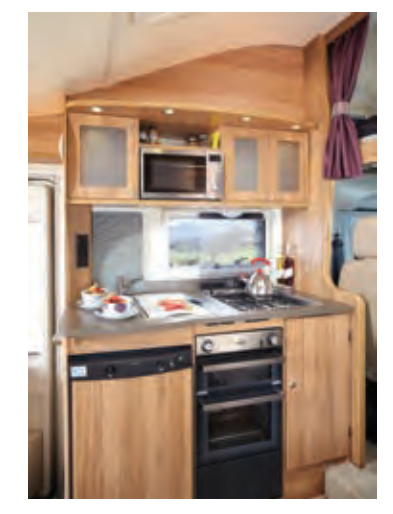
Approach SE 760 Kitchen