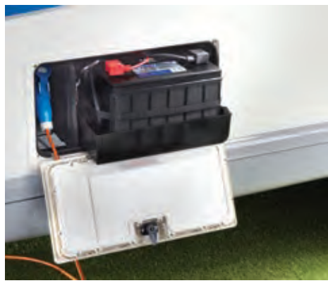
105Ah auxiliary battery

Built with practicality in mind models come supplied with a 105Ah auxiliary battery to give greater independence away from a mains power source and a 100 litre fully insulated external fresh water tank for continuous supply in cold temperature conditions. The dual fuel Truma 'Combi' central heating system provides effective heating en-route or on site and combines with the superior performance of the Alu-Tech bodyshell to make the Approach SE a genuine fourseason vehicle.