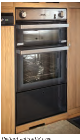
Thetford 'anti-rattle' oven