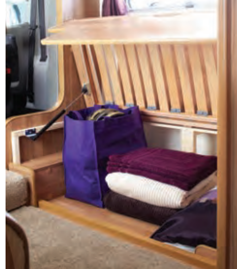
Lift up front bed boxes provide easy access to ground level storage (model specific)