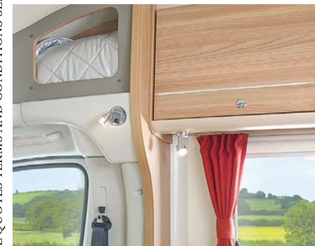
SILVER SCREENS INSTEAD OF BLINDS Removable silver screens, stored in a cubby above the cab doors, are stuck on the side windows at night