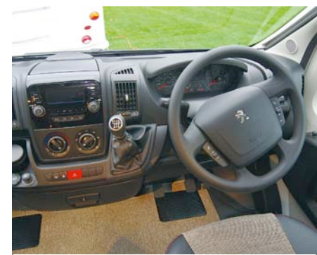
PREMIUM PACK IS A MUST-HAVE Cab air con, Bluetooth phone connection and DAB radio/CD player are all part of the Premium Pack