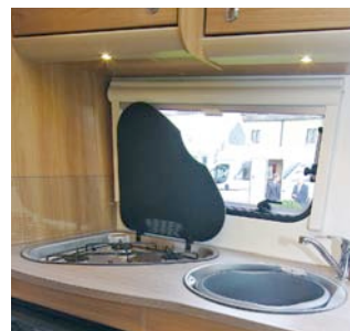
TINY TOP, BUT WELL LIT The kitchen is inevitably short on worktop, and close proximity to the entrance door means there's no extension, but it's well lit