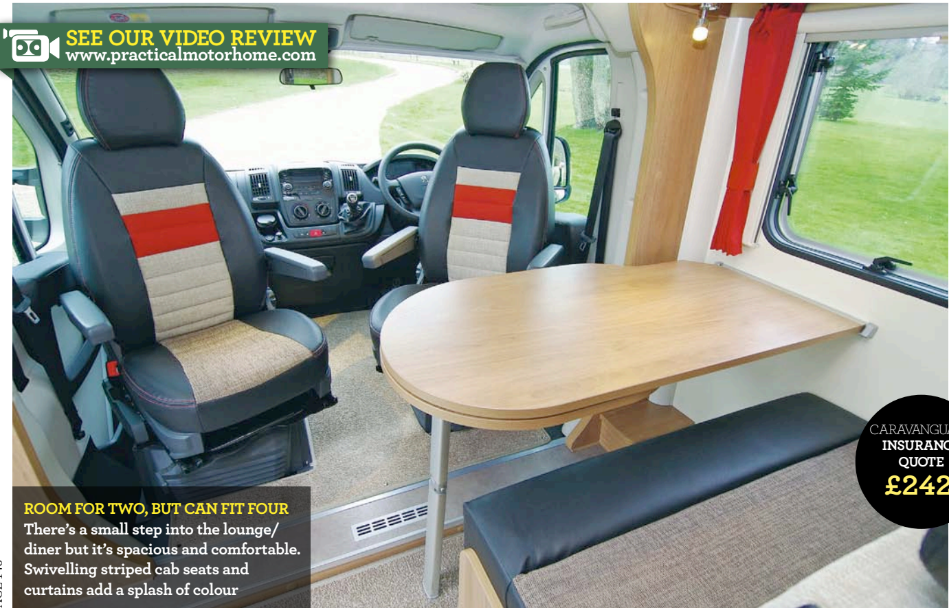
ROOM FOR TWO, BUT CAN FIT FOUR There's a small step into the lounge/diner but it's spacious and comfortable. Swivelling striped cab seats and curtains add a splash of colour