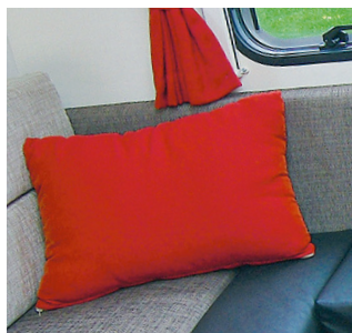
SEEING RED Vivid red curtains and scatter cushions in the lounge provide contrast and a dash of colour to the otherwise muted interior

Minor niggles aside, Bailey seems to have hit the bullseye with the new Advance range. It's so impressive, we can't help wondering what - space aside - the bigger, dearer Autograph offers that the Advance doesn't.