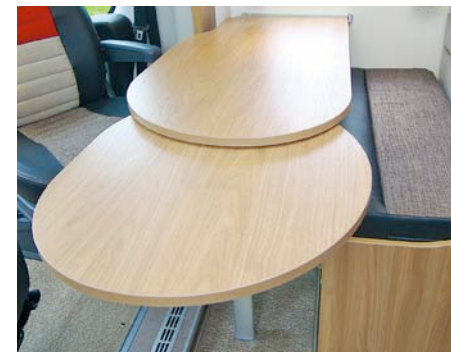
THERE'S SPACE FOR A FOURTH DINER A space-saving swing-out extension to the simple clip-on dining table easily reaches the passenger cab seat