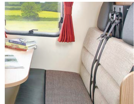
SAFETY FIRST Fully belted travel seats will help with the school run, but they preclude the fitting of a second reading light

* FOR INSURANCE QUOTES TERMS AND CONDITIONS SEE PAGE 146