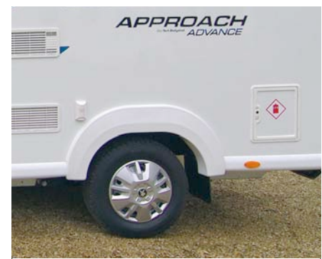
SLIM BODY IS EASIER TO MANOEUVRE The conversion is barely wider than the base vehicle cab, so it's easy to drive even on narrow roads