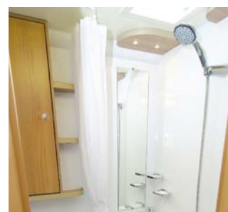
ROOM FOR ABLUTIONS Huge shower cubicle is fully lined. The shower curtain separates the shower from the toilet. There's good storage in this area, too