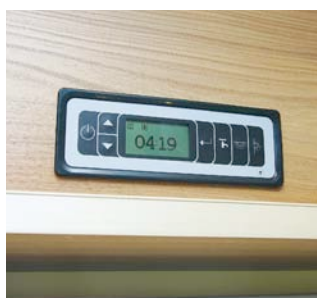
ALL UNDER CONTROL Simple LCD controls are located above the 'van's habitation door for mains lights, water pump and the awning light