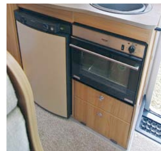
EVERYTHING YOU NEED A combined oven and grill, and good-sized fridge, provide the necessary kit and still leave room for decent storage solutions