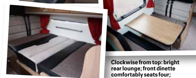
Clockwise from top: bright rear lounge; front dinette comfortably seats four; converted for night-time