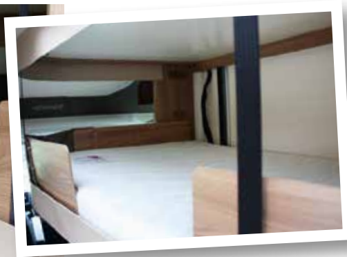
Left and above: longitudinal bed still allows access to kitchen and cab

There was no remote locking via the key fob (so the cab can only be unlocked externally from the driver's door), and there were padded covers instead of blinds for the cab's side windows – but these are all things you can easily live without.