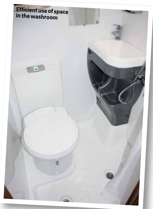
Efficient use of space in the washroom

The Advance 665 scores highly as a practical family motorhome and offers great value for money. Driving it was easy and it acted as a comfortable, spacious base for our outdoor activities. The specification also seems more than adequate for a family's needs.