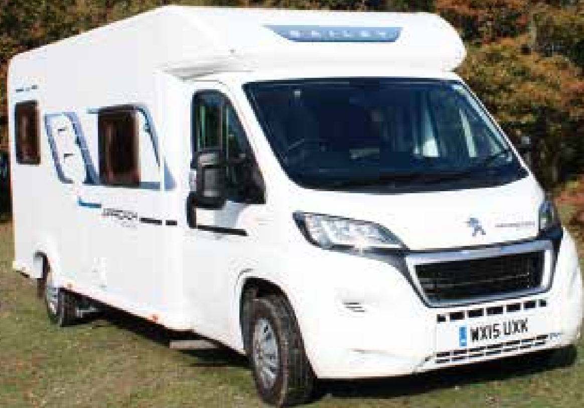
Advance is slightly narrower than top-of-the-range Autograph